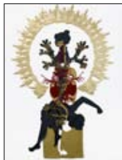
Going into theatre I , 2010. Cut fabric, heat set adhesive, dress pins on wall. 280 x 164 x 2.5 cm.