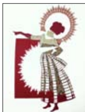
Going into theatre II , 2010. Cut fabric, heat set adhesive, dress pins on wall. 189 x 152 x 2.5 cm.