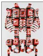
Cerebral ceremony , 2010. Silk, dress pins, heat set adhesive on board 1000 x 700 cm.