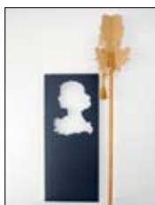
Piece by piece I , 2010. Laser cut MDF, oak timber, acrylic paint, fabric, found tassels. Dimensions variable.