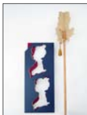
Piece by piece I , 2010. Laser cut MDF, oak timber, acrylic paint, fabric, found tassels. Dimensions variable.