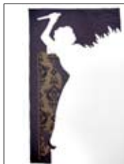
Remnants of relics , 2010. Cut fabric, heat set adhesive, dress pins on wall. 190 x 110 cm.