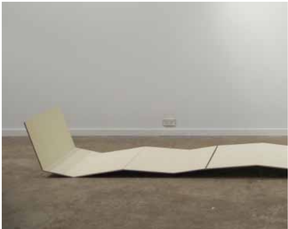
Bonita Bub, Nicotine Yellow-11 , 2010 acrylic on marine ply, piano hinges dimensions variable