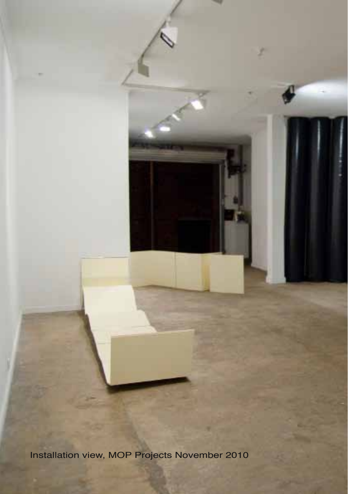
Installation view, MOP Projects November 2010